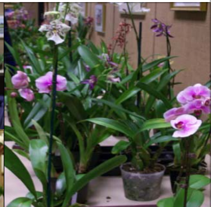
Orchids of all shapes and sizes were available for people to view and buy at the annual auction!